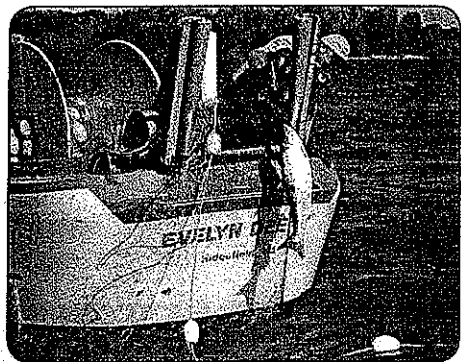
Overharvest has led to a decline in the Pacific Northwest Salmon stocks.

Millions of fish that should return to spawn in the region's rivers and streams are harvested in the ocean. As a result, wild fish never return to spawn, and the hatchery fish that Pacific Northwest residents pay for never return for local commercial and sport fishermen to harvest. ©